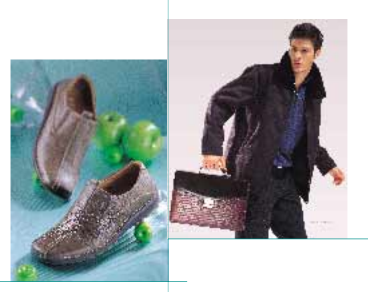
Trendy products of Goldlion from our licensees

During the year, the Group also implemented a special bonus scheme to reward those staff who have contributed to the Group's strategic decisions and development.